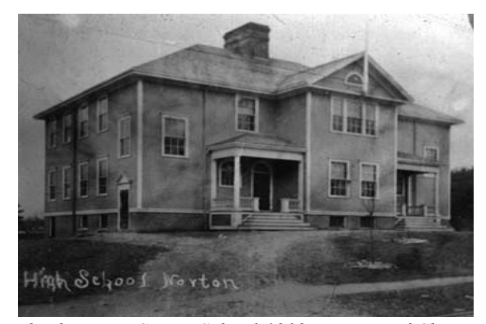
Photograph of Norton Center School 1902, courtesy of Christopher Cox

In addition to working bog iron and farming, early Norton industries included gristmills and lumbering. The keel of the frigate "Constitution" is said to have been cut from oak trees found within the Norton Great Woods. In the nineteenth century, textile mills, bleacheries, a wool-combing mill, home and factory manufacturing of straw hats, basket-making, jewelry manufacturing, and producing boxes for the jewelry trade flourished. On Taunton Avenue, a plant stamped out the copper disks from which the old-style large copper pennies were minted.