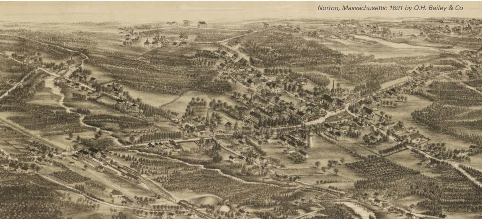
Norton, Massachusetts: 1891 by O.H. Bailey & Co