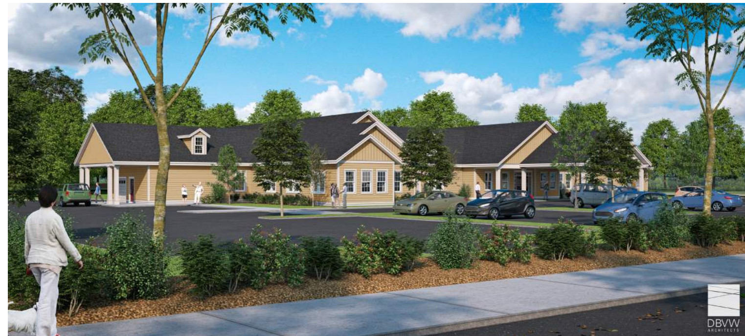
Conceptual Rendering | View towards food pantry