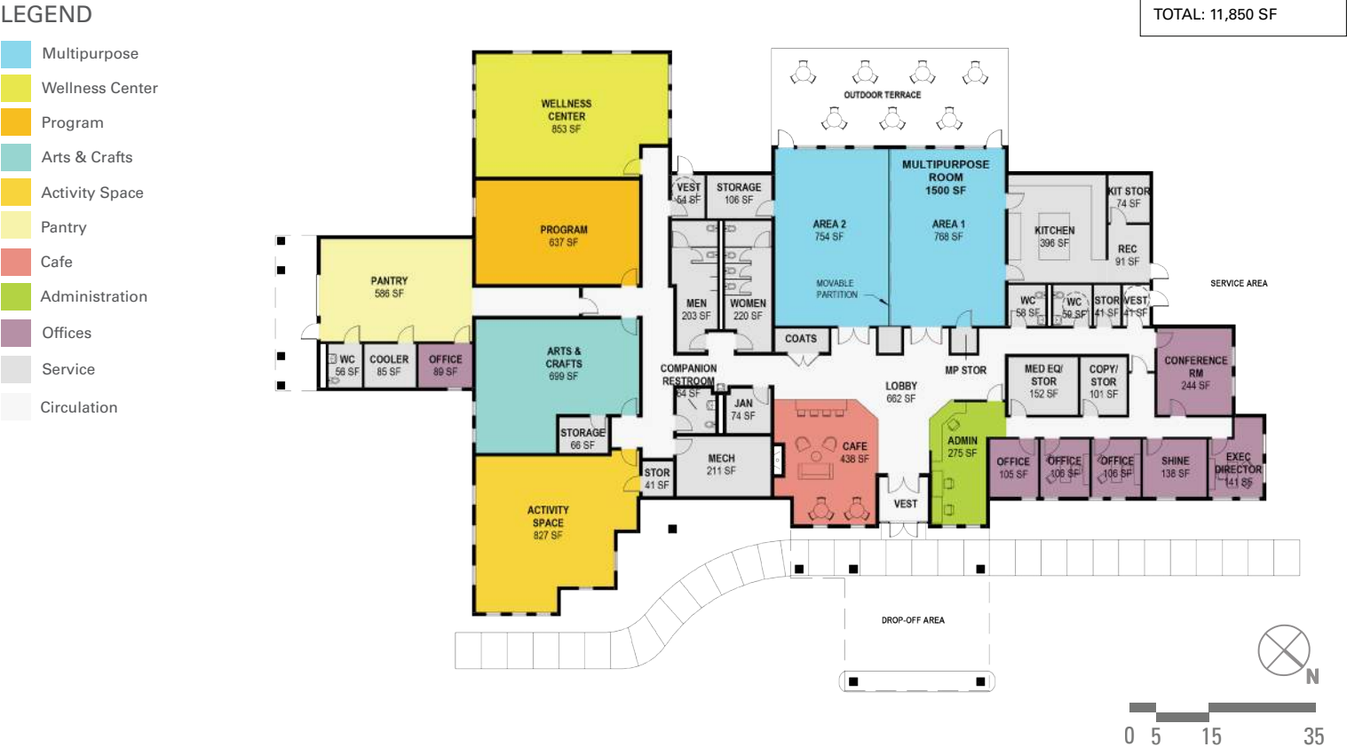
Conceptual First Floor Plan