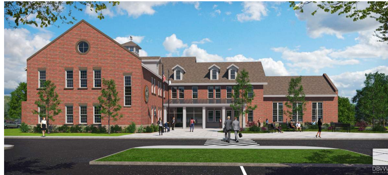
Conceptual Rendering | View towards front entry