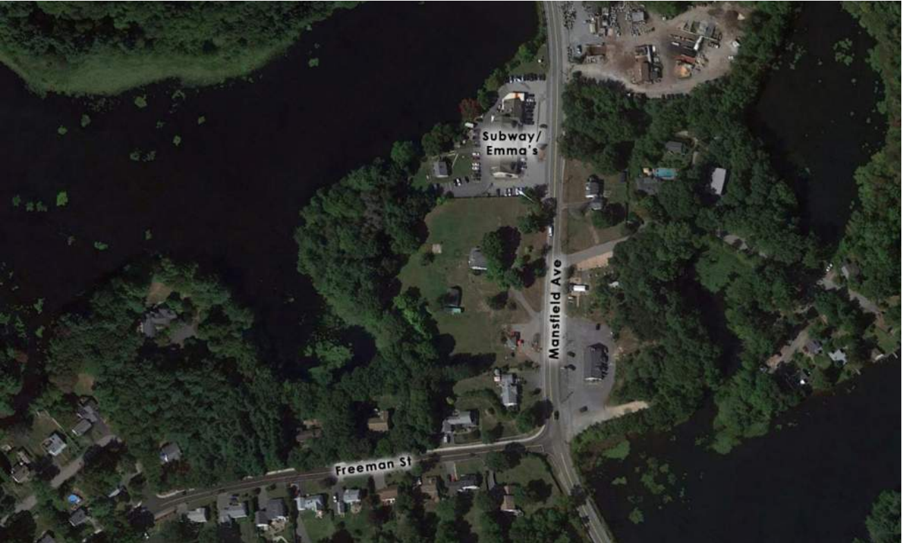
Site: 120 Mansfield Ave