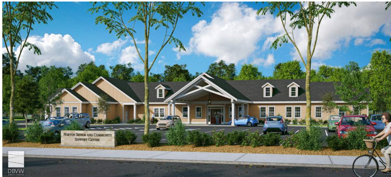
Conceptual Rendering | View towards front entry