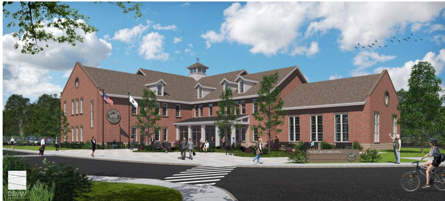
Conceptual Rendering | View towards pedestrian plaza