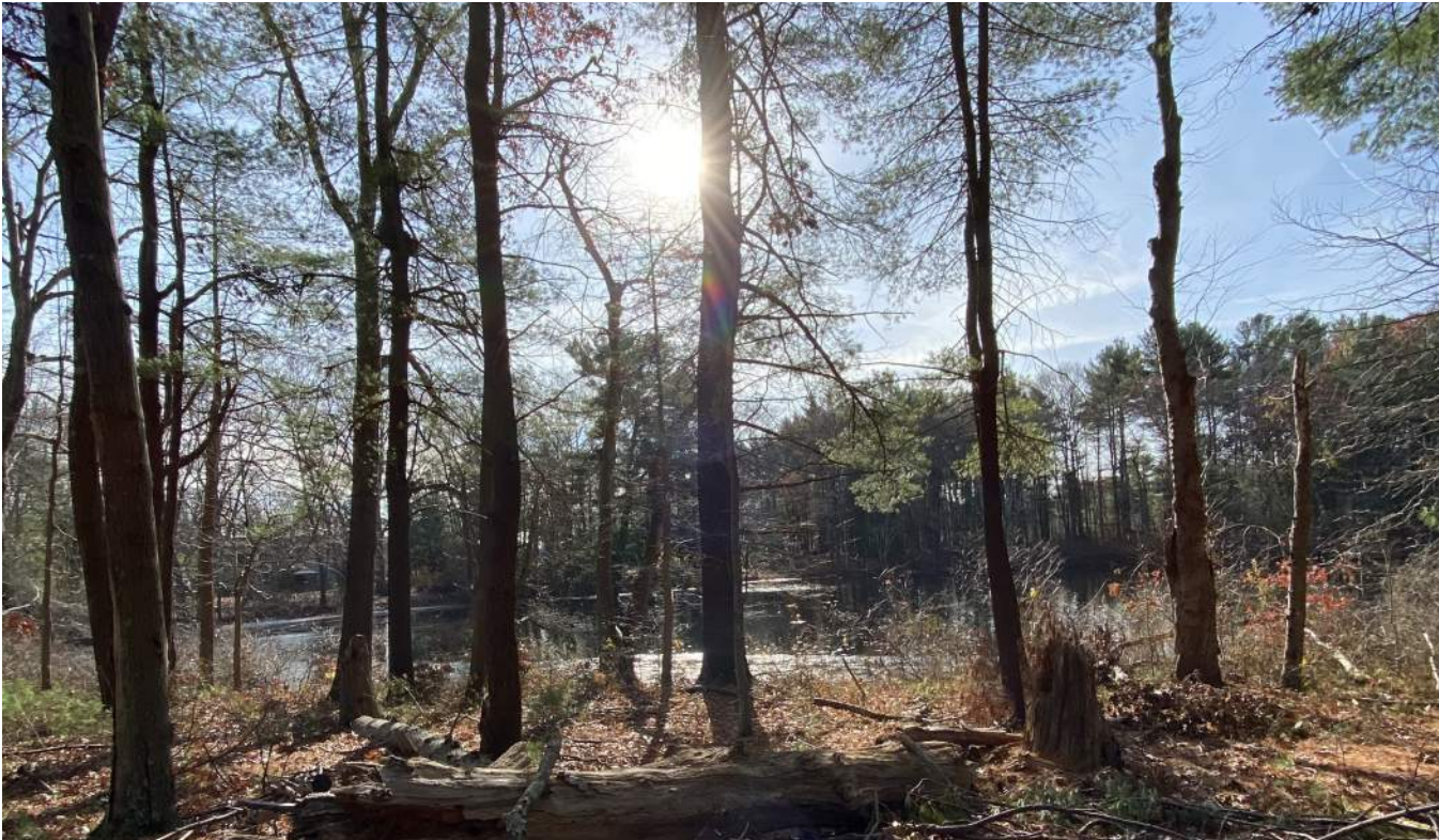
Existing view towards reservoir