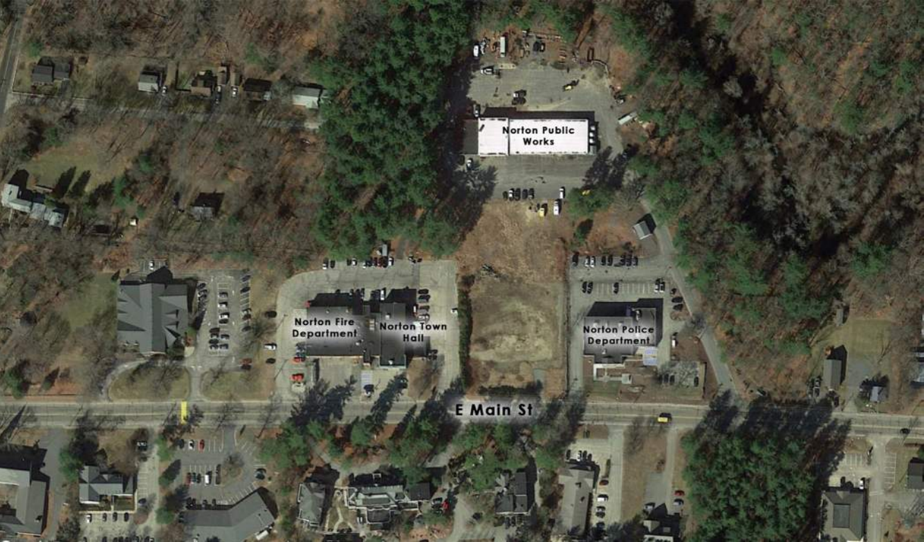
Site: 78 E Main St