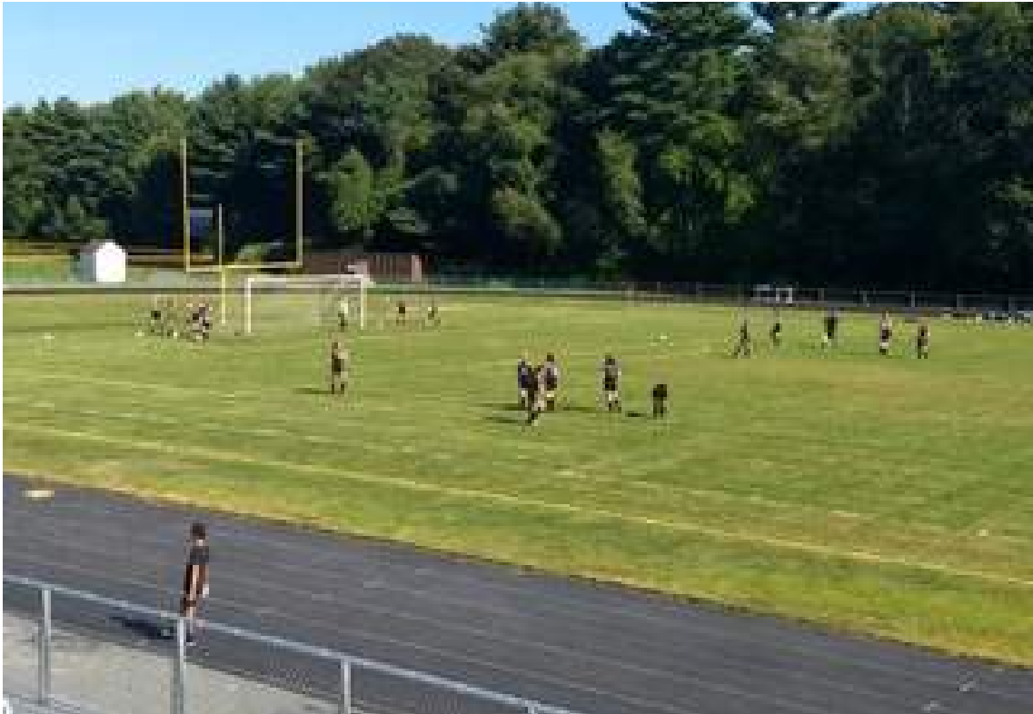
Site: 64 W Main St